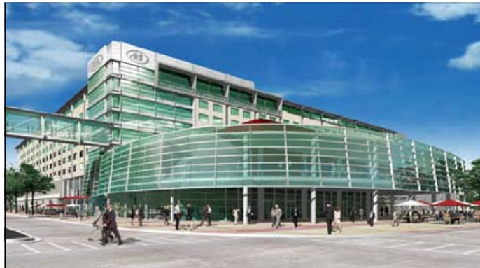
The Hilton Omaha Hotel at 10th & Cass streets opened March 31st.

eral guests in town for the Commercial Real Estate Workshop said it was one of the most luxurious hotels they had ever experienced.