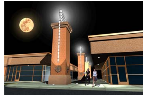
Spring Ridge Plaza Phase II

Coldwell Banker Commercial World Group is managing three new retail properties in west Omaha for Hoich