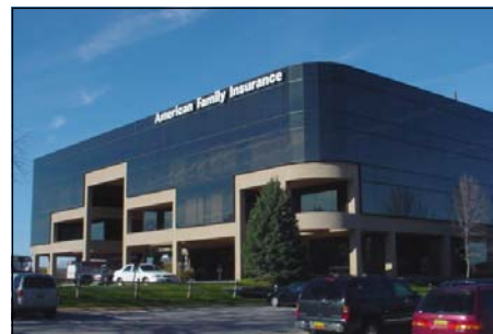
The Mark 9290 West Dodge Road

Regency Westpointe , 10330 Regency Parkway Drive, is a three-story class "A" office building in the prestigious Regency area with visibility from Interstate 680. This property is currently