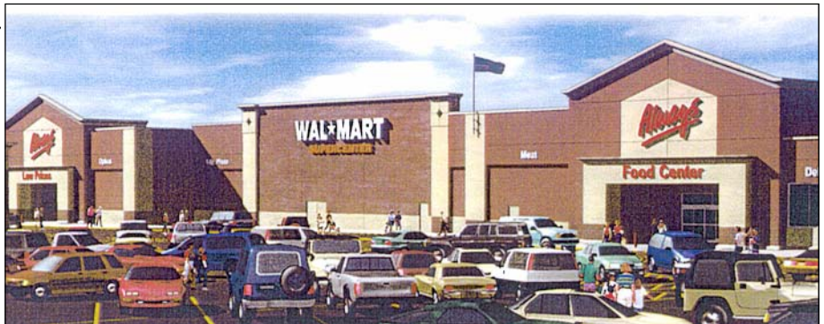
Artist's rendering of the 203,000 sq. ft. Wal-Mart Super Center scheduled to open next summer at The Thomsen Mile northwest of 168th & West Maple Road.

may be combined. Coldwell Banker Commercial World Group is the leasing agent for The Shoppes at Thomsen Mile.