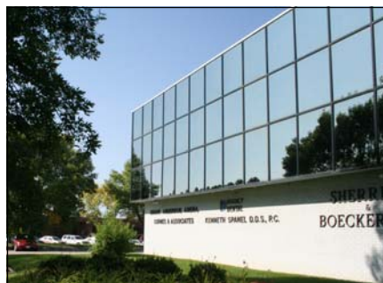
Regency Professional Plaza at 260 Regency Parkway Drive

CBCWG is the new manager for two high-profile properties. Regency