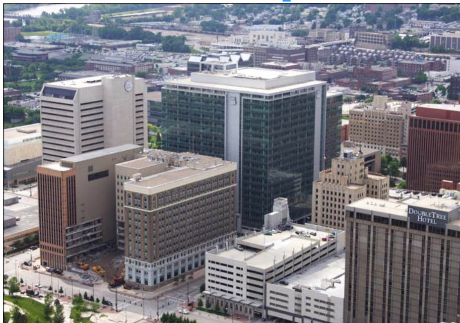
Demolition has started on the old Union Pacific building (front left) to make way for the 32-story Wall Street Tower, which will include some retail space. The new U.P. building is immediately south.