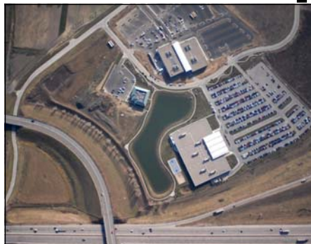
The PayPal, Inc. campus, part of Southport East in La Vista, is visible in this aerial. CBCWG has other lots listed for sale nearby.

LinkedIn Corp., the world's largest professional network, chose Omaha for its first sales and service center. LinkedIn, which is adding 130,000 customers per week, plans to grow